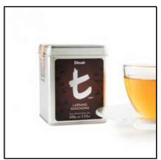
t-Series Lapsang Souchong