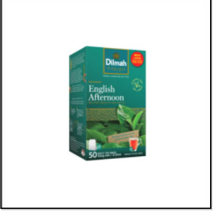
Gourmet English Afternoon