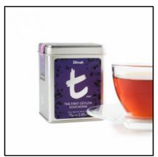
t-Series The First Ceylon Souchong