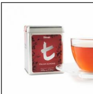
t-Series Italian Almond Tea