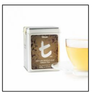
t-Series Ceylon Whole Leaf Green Tea