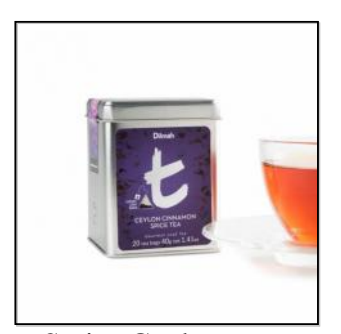
t-Series Ceylon Cinnamon Spice Tea