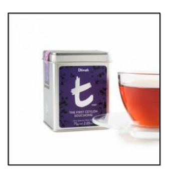
t-Series The First Ceylon Souchong