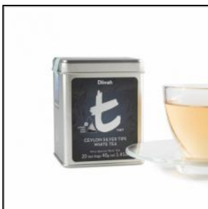
t-Series Ceylon Silver Tips White Tea