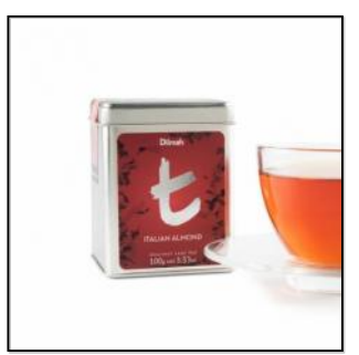
t-Series Italian Almond Tea