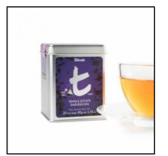
t-Series Single Estate Darjeeling