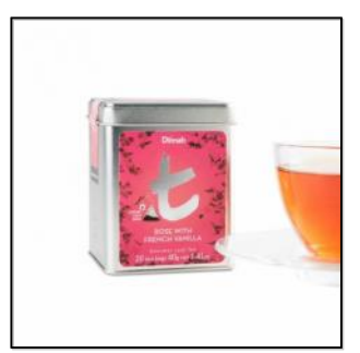
t-Series Rose With French Vanilla