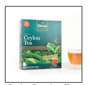
Ceylon Premium Tea