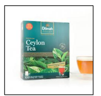
Ceylon Premium Tea