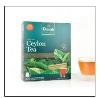
Ceylon Premium Tea