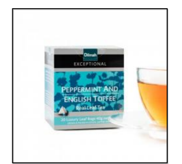
Exceptional Peppermint and English Toffee