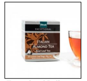
Exceptional Italian Almond Tea