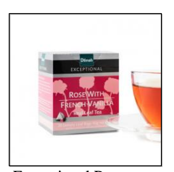
Exceptional Rose With French Vanilla