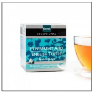
Exceptional Peppermint and English Toffee