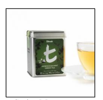
t-Series Moroccan Mint Green Tea