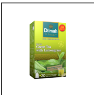
Pure Ceylon Green Tea with Lemongrass