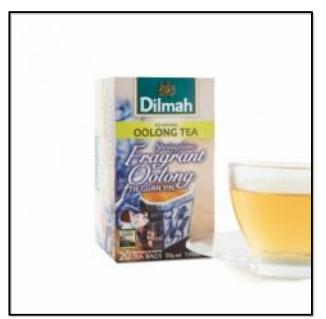
Springtime Fragrant Oolong